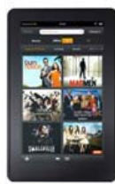
Tale of the Tablets: Comparing New Devices more...