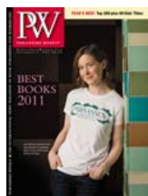
PW's Best Books of 2011