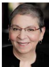
The PW Libraries Page more...